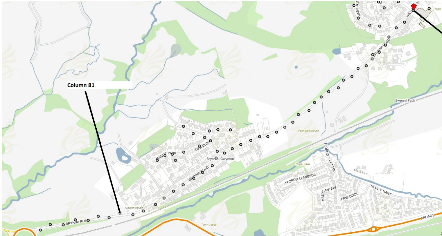
Brynna Road lampposts 2 of 2