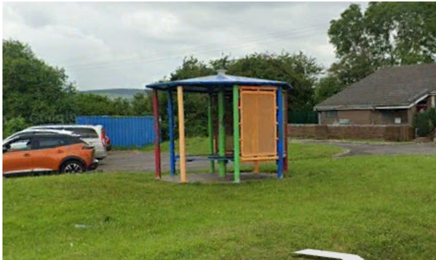
Youth shelter located near shopping centre in Talbot Green