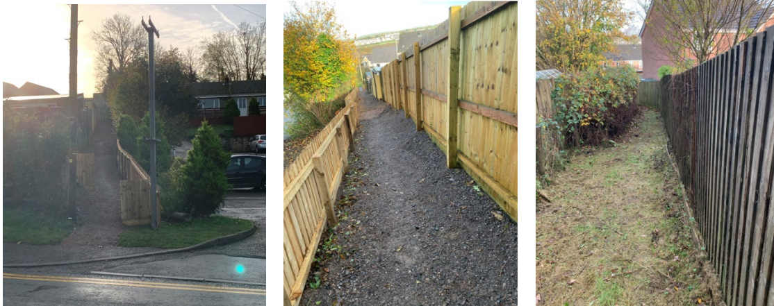
Recently completed northern section of RAN 17/5

Following a previous resolution of Council and the application of CIL funds to the project, RAN 17/5 has been put back into use and the access problems at the northern end of the path have been resolved. See pics below.