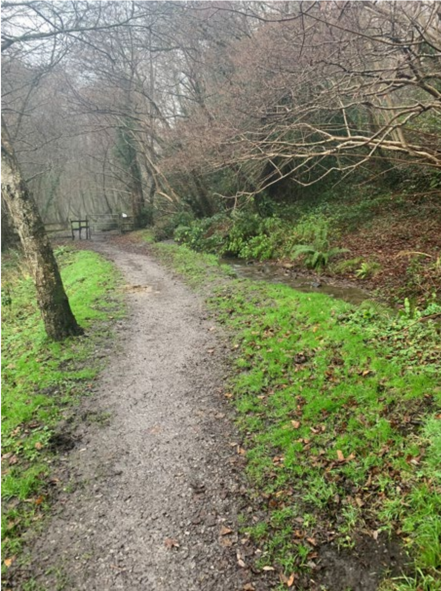
Picture 2 – Section of PSM40/4 leading to entrance of the woods, looking westwards towards the woods.

The issue here appears to be flooding during periods of rainfall from the stream on the right hand side of the photograph.