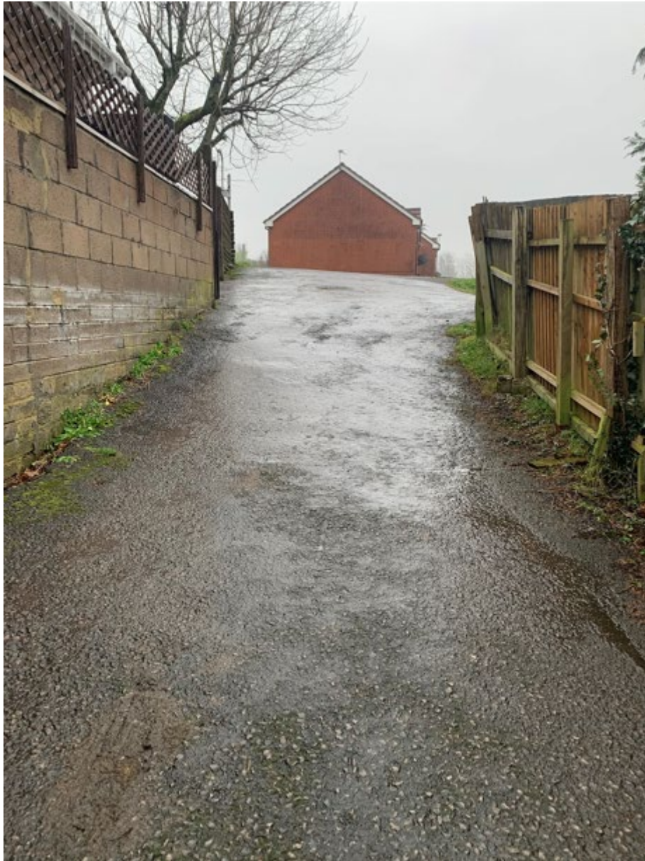
Picture 1a – Section of PSM40/4 leading immediately from Bethlehem View looking eastwards back towards Bethlehem View.

This photograph more accurately captures the extent of the gradient and the condition of the asphalt surface.