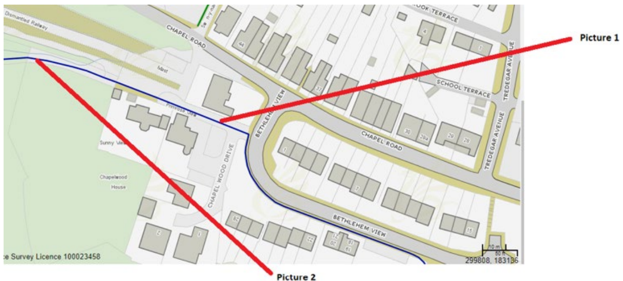
Plan showing route of PSM 40/4