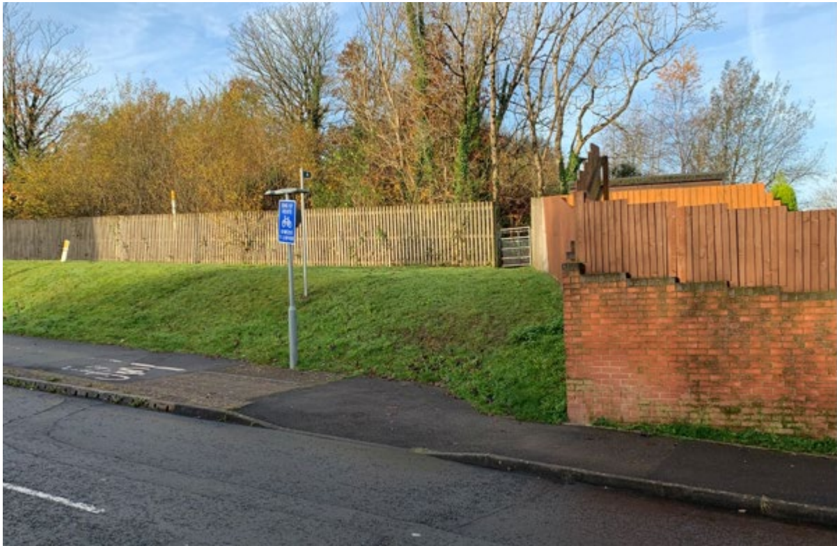
Picture 1 - Location of the Southern entry point of this section of RAN 17/5

Currently access is either up the steep bank or alternatively walking along the ridge of the bank.