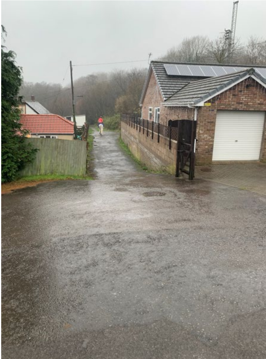
Picture 1 – Section of PSM40/4 leading immediately from Bethlehem View looking westwards towards entrance to the woods.