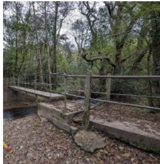
The existing narrow pedestrian bridge over the River Ewenny, to be replaced.