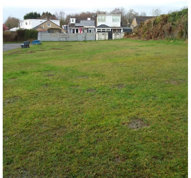
Image shows location of proposed wildflower area.

Blue markings are approximate locations of new football goalposts.