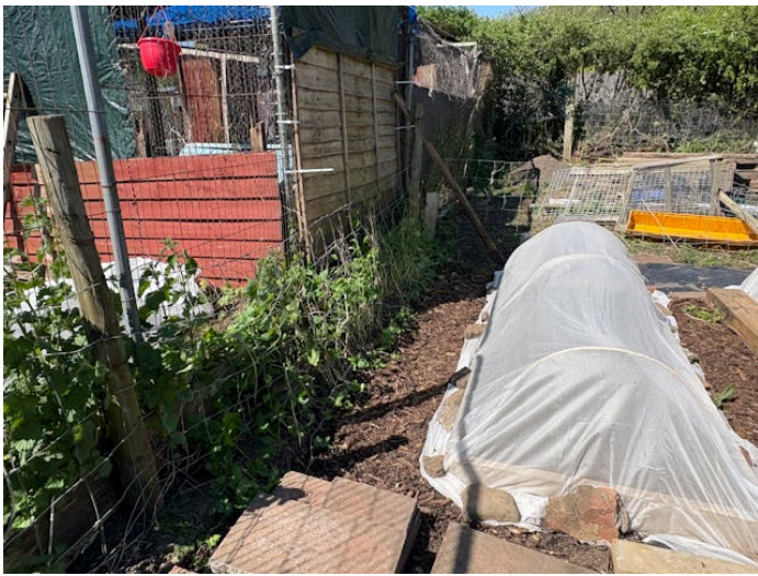
After removal of asbestos containing materials