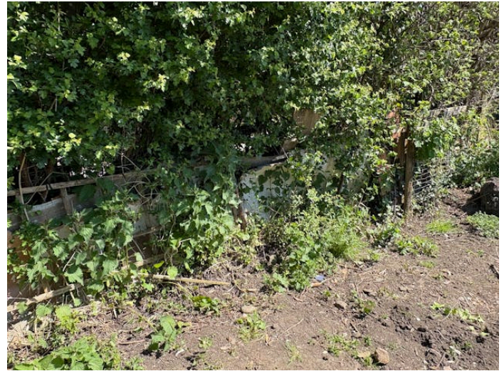
After removal of asbestos containing materials