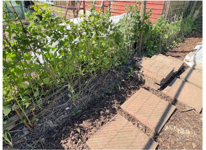
After removal of asbestos containing materials