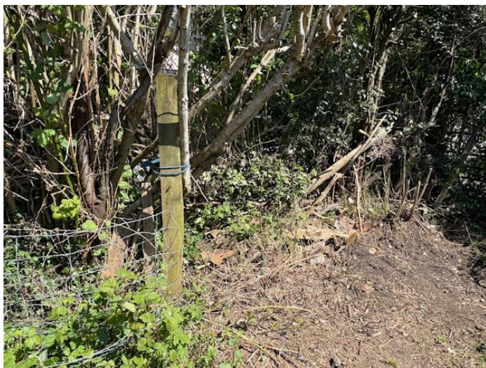
After removal of asbestos containing materials