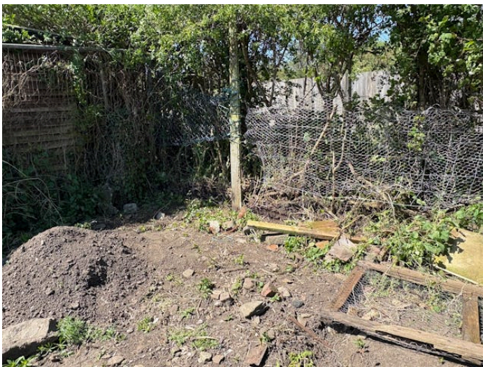
After removal of asbestos containing materials