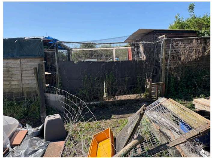
After removal of asbestos containing materials