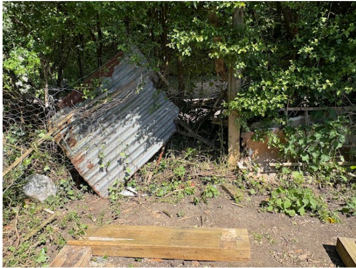
After removal of asbestos containing materials