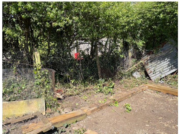
After removal of asbestos containing materials