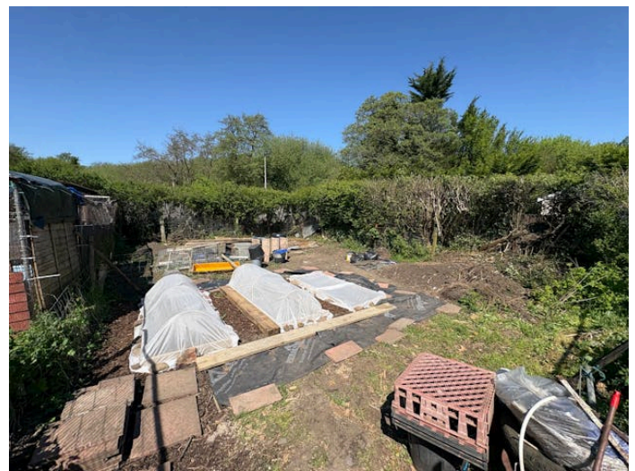
After removal of asbestos containing materials